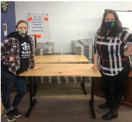
Stocking the showroom at the Habitat for Humanity Store

“Every time we receive a shipment from FRS, we see a boost in sales. We know FRS will deliver high quality product. The more we sell, the better we fulfill our mission of providing affordable housing to those in need.”